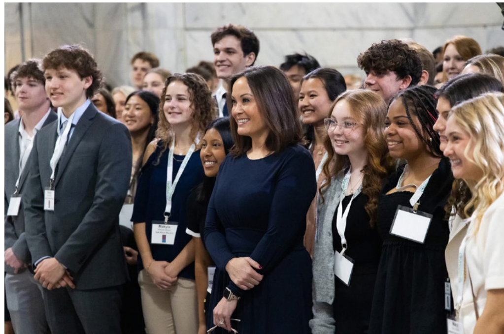
2025 JPEC delegates with Lt. Gov. Jacqueline Coleman at the Capitol in Frankfort.

Eligible applicants included high school juniors who reside within JPEC's service area and whose parents or guardians are members of the cooperative. Students completed a competitive application process that included an essay, academic